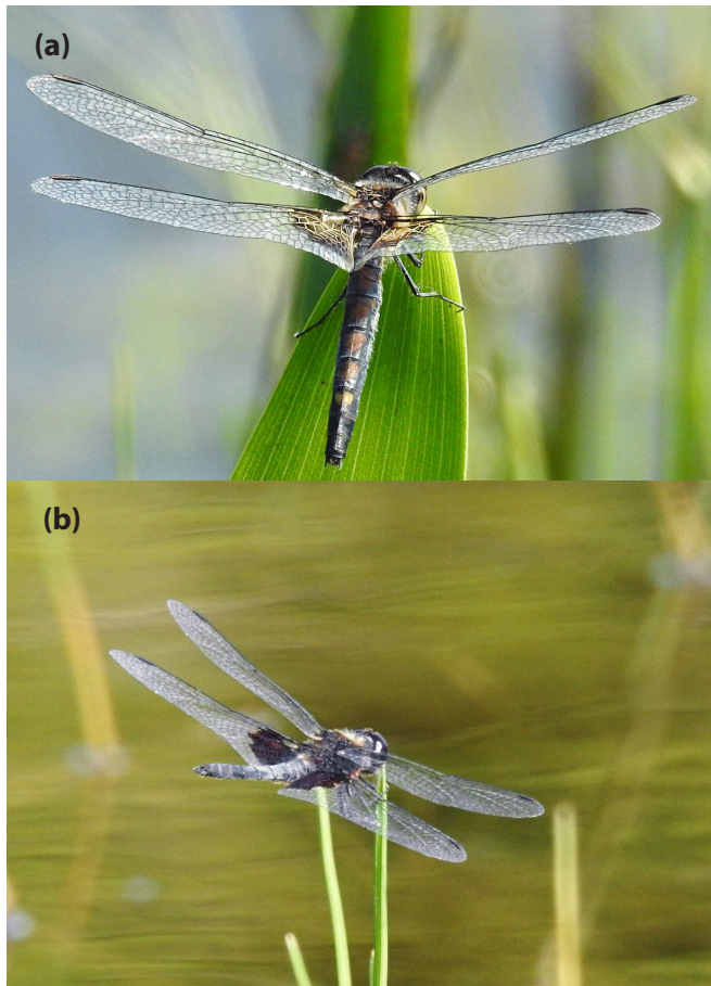
Figure 4. Celithemis martha , female (a), Kerrs Lake, Charlotte County, New Brunswick, 22 July 2016 and male (b), St. Patricks Lake, Charlotte County, New Brunswick, 20 August 2016. (Photo credit: J. Bell).

Enallagma pictum is an eastern North American Atlantic Coastal Plain endemic with a limited range. Bick (2003), in reviewing at-risk Odonata in the United States, ranked Enallagma pictum as rare. The species is conservation-listed as Near Threatened by the International Union for the Conservation of Nature (IUCN; Abbot 2007) and Vulnerable by NatureServe (NatureServe 2017). Prior to the New Brunswick discovery, the range of Enallagma pictum was known to extend from New Jersey north to southern Maine (Nikula et al. 2007), being recorded in Maine for the first time as recently as 1999. The New Brunswick population represents a range extension of 180 km to the northeast. Southwestern New Brunswick, including Cranberry and Moores Mills Lakes, has been surveyed repeatedly for Odonata (20 and 12 visits respectively) by PMB and others from 1992-2015 during the known flight period for Enallagma pictum in southwest Maine (July and August). The most intense Odonata survey work