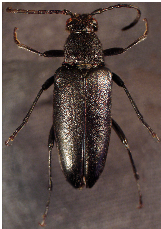
Fig. 4. Dorsal habitus of Pygoleptura nigrella nigrella (Say) collected in Point Pleasant Park, Nova Scotia. Length: 17.0 mm.

of the Nova Scotia Museum for ongoing support.