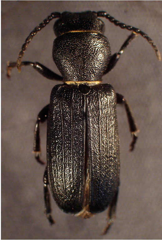
Fig. 1. Dorsal habitus of Neospondylis upiformis (Mannerheim) collected in West Big Intervale, Nova Scotia. Length: 9.5 mm.