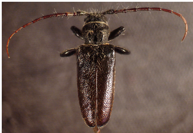
Fig. 3. Dorsal habitus of Semanotus litigiosus (Casey) collected in Dundee, Nova Scotia. Length: 15.0 mm.

(2004) and from Prince Edward Island by Majka et al. (2007). We provide two additional records that further extend its known distribution in Nova Scotia: Halifax County: Point Pleasant Park (44° 37' 17.6" N; 63° 34' 11.9" W), 5 August 2001, C.G. Majka, coniferous forest (Fig. 4); Pictou County: Waterside Provincial Park (45° 45' 29.2" N; 62° 47' 15.9" W), 23 July 2007, K. Moore, flight intercept trap. While the number of records in the region is few, Pygoleptura nigrella nigrella appears generally distributed in the Maritime Provinces, although it has not been recorded on Cape Breton Island (Fig. 2).