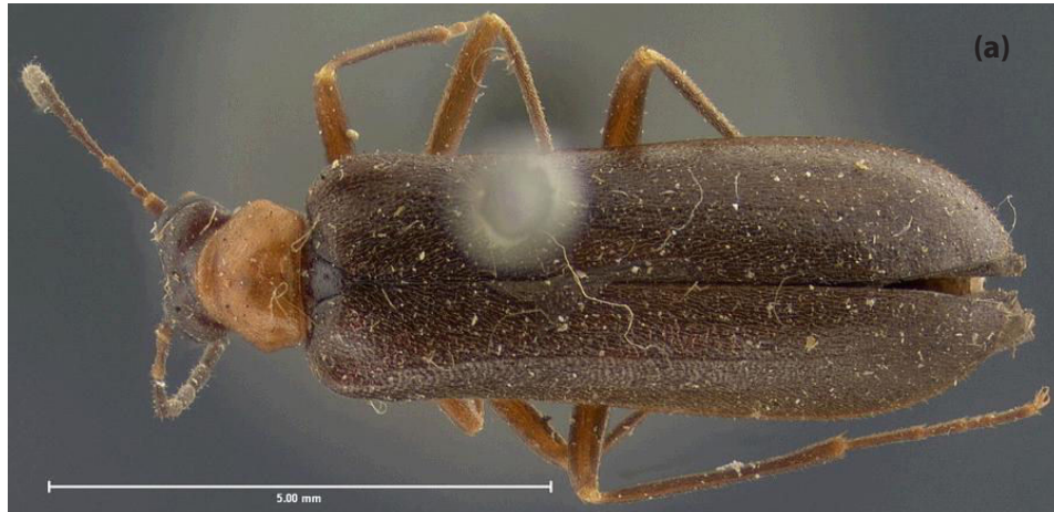
Figure 1. Habitus photograph of the type specimen of Nematoplus collaris LeConte (a); Cephaloon lepturides Newman (b); Cephaloon unguare LeConte (c); Stenotrachelus aeneus (Fabricius) (d).