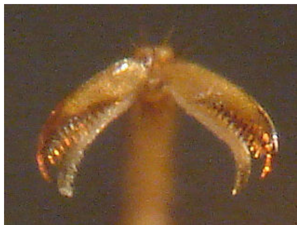
Figure 5. Pulvilli of Cephaloon unguare LeConte. Note: Note the slender pulvilli (tarsal pads) that are apically pointed and curved.

between 8 June and 13 August with numbers reaching a peak in the first half of July (Fig. 3). Almost all specimens were collected with flight intercept or malaise traps.