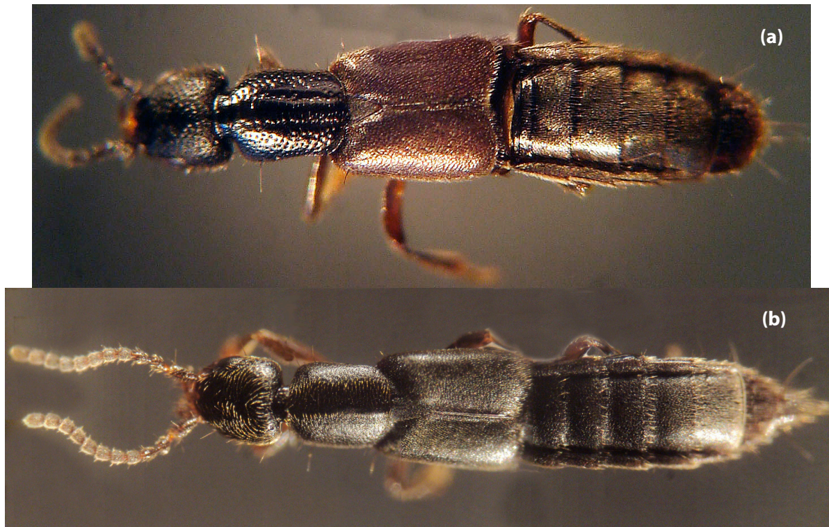
Figure 1: Dorsal habitus photograph of Cafius bistriatus (a) and Cafius aguayoi (b).

punctures, and the median line is bordered by a contiguous region of finer and more closely-separated punctures that extends to the lateral margins of the pronotum.