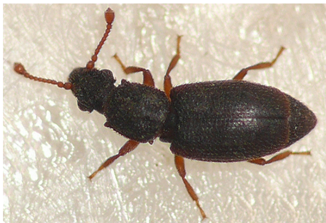
Fig. 9. Dorsal habitus of Monotoma picipes .

Breton Island (Fig. 6) and it has been recorded throughout most of North America where it is typically found in decaying vegetable matter, under the bark of pine logs, in moss, seaweed, and occasionally in association with ants (Bousquet and Laplante 1999). Monotoma picipes has been found throughout Europe except for Albania, Belgium, Bosnia-Herzegovina, Bulgaria, and Macedonia where it has not been recorded. It is also found across North Africa and across Siberia to the Russian Far East, and south to China, Korea, Japan, and throughout central Asia (Jelínek 2007).