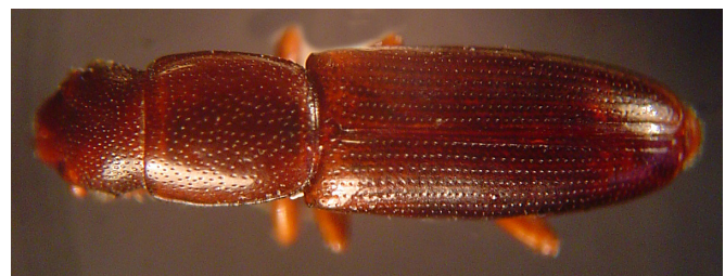
Fig. 3. Dorsal habitus of Rhizophagus dimidiatus .

NEW BRUNSWICK: Northumberland Co.: Chatham, June 7, 1991, P. Kaanar (1, CNC).