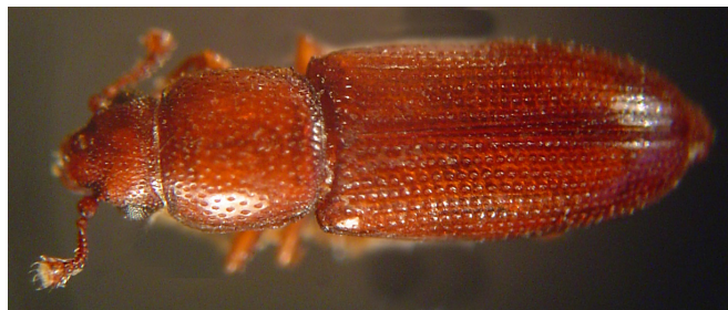
Fig. 1. Dorsal habitus photograph of Rhizophagus brunneus brunneus.