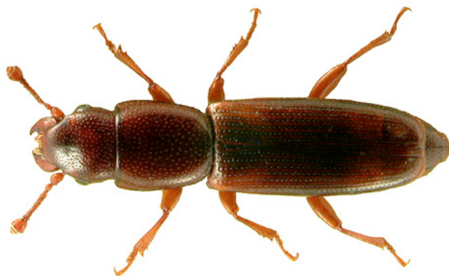
Fig. 4. Dorsal habitus of Rhizophagus parallellocollis (Length = 3.0 mm).

Rhizophagus parallellocollis has previously been recorded from both Nova Scotia and insular Newfoundland (Bousquet 1990). The only record of this adventive Palaearctic species in the Maritime Provinces is from 1957 in Waverley, Nova Scotia. The bionomics of this species are unusual; in Europe it is known as the “graveyard beetle” since it is frequently found in graves, swarming on corpses in coffins where it is associated with dipterous larvae on which they may feed. The species is also found in fungi, soil, mammal nests, on mould, plant refuse, old bones, and at sap (Bousquet 1990). Rhizophagus parallellocollis is widely distributed throughout Europe, from northern Russia and Scandinavia south to the Mediterranean including Great Britain and Ireland and the Black Sea coast (Jelínek 2007).