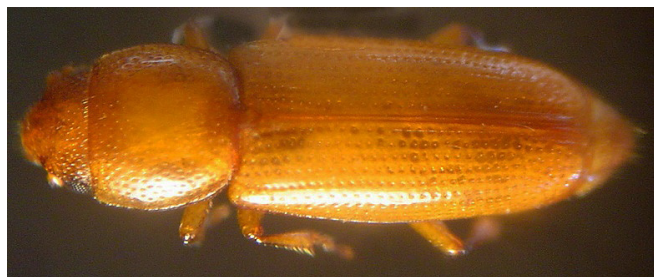
Fig. 5. Dorsal habitus of Rhizophagus remotus.