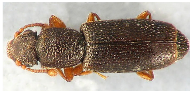
Fig. 8. Dorsal habitus of Monotoma longicollis .

CBU); Kings Co.: Kentville, August 10, 2005, D.H. Webster, compost heap, moldy corncobs (1, DHWC).