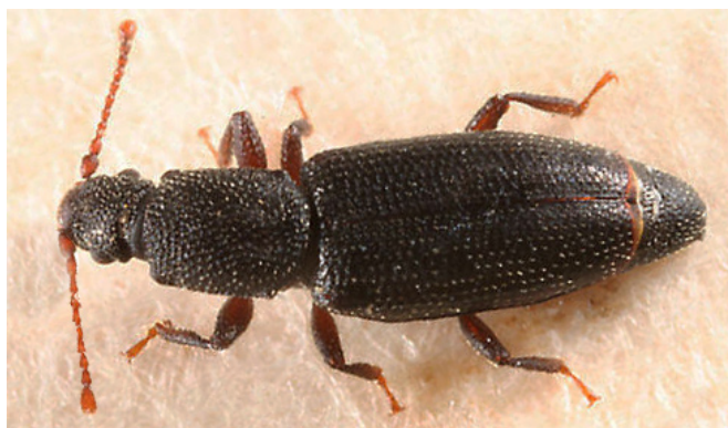
Fig. 10. Dorsal habitus of Monotoma producta .

NEW BRUNSWICK: Albert Co.: Mary's Pt., August 23, 2003, C.G. Majka, coastal dunes, under flotsam (1,