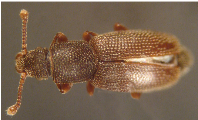
Fig. 7. Dorsal habitus of Monotoma bicolor (Length: 1.9-2.5 mm).

Monotoma bicolor has previously recorded from New Brunswick by Bousquet and Laplante (1999). There is only one record of this adventive Palearctic species from the region (Fig. 6). The species is widely distributed in Europe from Northern Russia and Scandinavia south to the Mediterranean including Great Britain, Ireland, and the Mediterranean islands. It is also found across North Africa, in Turkey and the Middle East, across Siberia