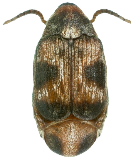
Figure 5. Dorsal habitus photograph of Bruchus pisorum (Linnaeus).