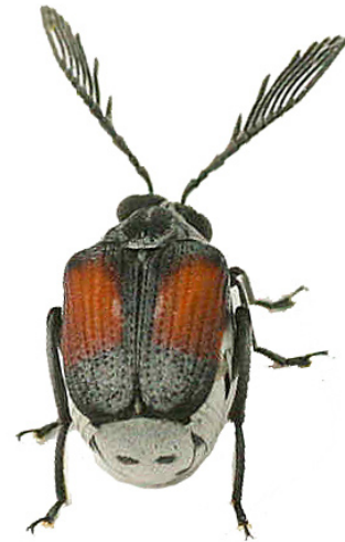
Figure 7. Dorsal habitus photograph of Acanthoscelides obtectus (Say).