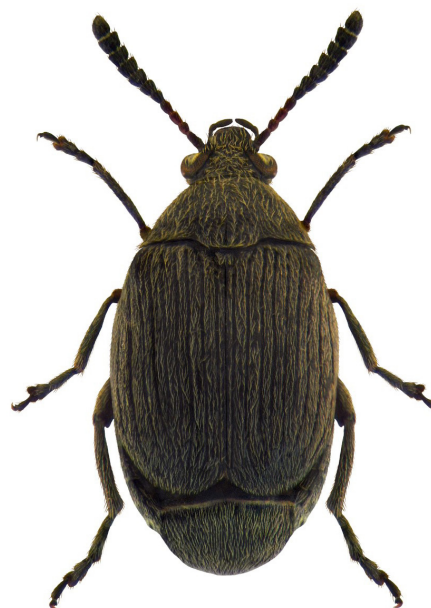
Figure 2. Dorsal habitus photograph of Bruchidius villosus (Fabricius).

Callosobruchus chinensis (Linnaeus, 1758)