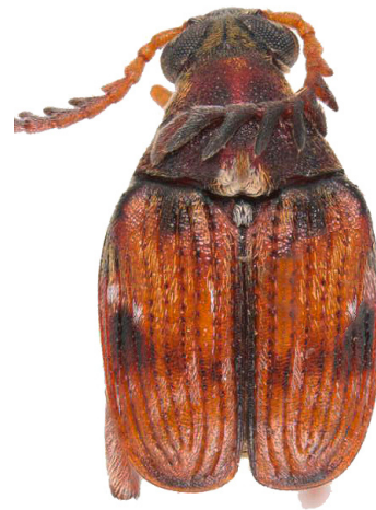
Figure 3. Dorsal habitus photograph of Callosobruchus chinensis (Linnaeus).

( Glycine max (L.) Merr.), hyacinth bean ( Lablab purpureus (L.) Sweet), blue sweet pea ( Lathyrus sativus L.), lentil ( Lens culinaris Medikus), lima bean ( Phaseolus lunatus L.), common bean ( Phaseolus vulgaris L.), pea ( Pisum sativum L.), winged bean ( Psophocarpus tetragonolobus (L.) D.C.), broad bean ( Vicia faba L.), moth bean ( Vigna aconitifolia (Jacq.) Marechal), black bean ( Vigna mungo (L.) Hepper), mung bean ( Vigna radiata (L.) R. Wilczek), and crowder pea ( Vigna unguiculata (L.) Walp.)